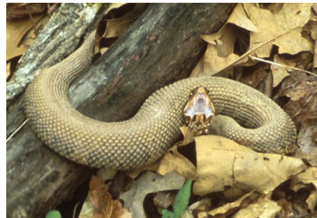
(water moccasin snake)

And don't let the water moccasins' name fool you—these snakes are also found away from bodies of water. "On bright, sunny days [water moccasins] are usually found coiled or stretched out somewhere in the shade. In the morning and on cool days they can often be seen basking in the sunlight. At night, however, they are at their most active, when they are usually found swimming or crawling" ( Agkistrodon piscivorus ).